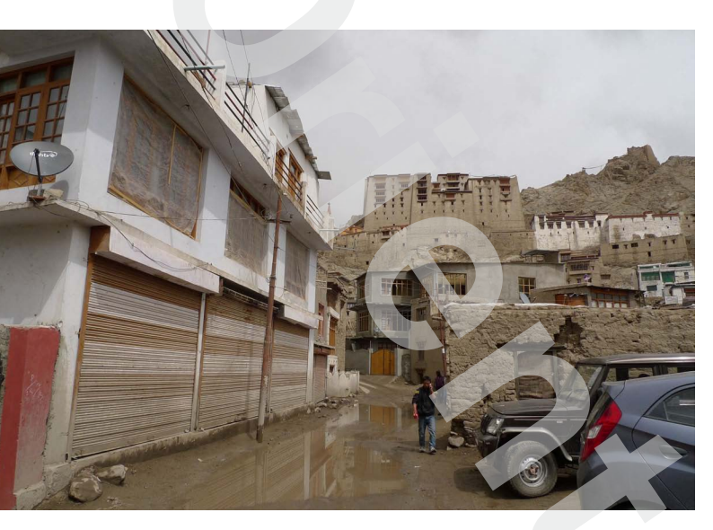
Every year, more new concrete structures are replacing the historic buildings in the Old Town, significantly impacting on a local economy that relies on tourism