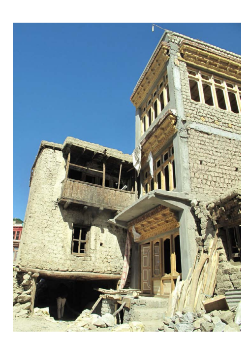
The historic Banday House (left), home of 19th century Ladakhi explorer Baba Kalam Rassul, its wood balcony now blocked in by the concrete balcony of a new tourist facility

buildings in Leh Old Town with individual concrete buildings measuring 25 square metres. Under urban planning criteria in India, concrete structures are categorized as permanent, and stone, adobe and wood structures as non-permanent, awaiting replacement. If this project were implemented, some 40 per cent of Leh Old Town would be replaced by standardized concrete boxes designed in mainland India, where the climate and other conditions differ radically from those in Ladakh. In its conservation programme for the Leh Palace, the Archaeological Survey of India (ASI) has relied on a Central Government act that forbids new construction within 100 metres of a protected monument and restricts construction within 200 metres. However, this ruling has