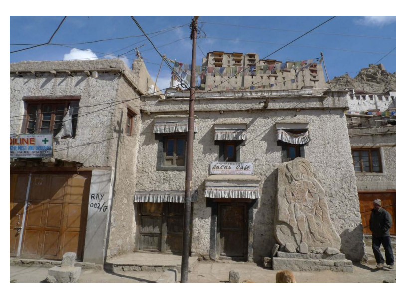
Lala's Café, a heritage house restored by THF in 2005, with the 11th century statue of Maitreya in front. The neighbouring house to the left has been marked with a RAY scheme code

not been used to curb private construction in the past or to moderate the implementation of the RAY scheme today, although the Leh Palace and the old town have potential to be listed in the UNESCO World Heritage List, and it is crucial to preserve the integrity and authenticity of sites to be nominated. Investment under the scheme will bring overall benefit in terms of infrastructure, but the replacement of historic buildings with concrete frame structures would result in a huge loss of cultural heritage and quality of life.