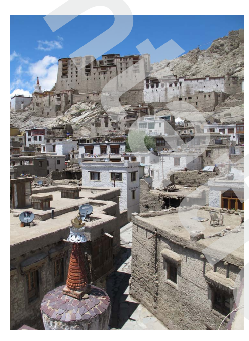
View of the palace overlooking traditional buildings in Leh Old Town

Over the same period, Ladakh's economy and society have likewise changed dramatically. The town of Leh has sprawled far beyond its traditional limits, and many of the