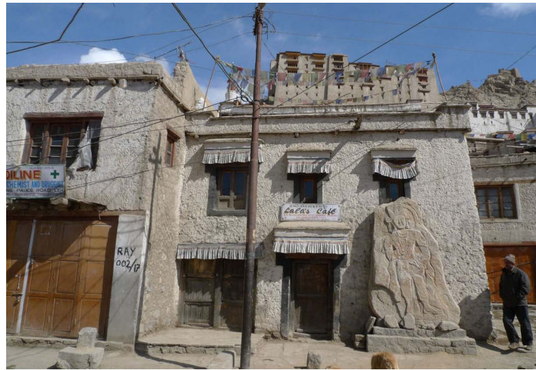
Lala's Café, a heritage house restored by THF in 2005, with the 11th century statue of Maitreya in front. The neighbouring house to the left has been marked with a RAY scheme code

not been used to curb private construction in the past or to moderate the implementation of the RAY scheme today, although the Leh Palace and the old town have potential to be listed in the UNESCO World Heritage List, and it is crucial to preserve the integrity and authenticity of sites to be nominated. Investment under the scheme will bring overall benefit in terms of infrastructure, but the replacement of historic buildings with concrete frame structures would result in a huge loss of cultural heritage and quality of life.