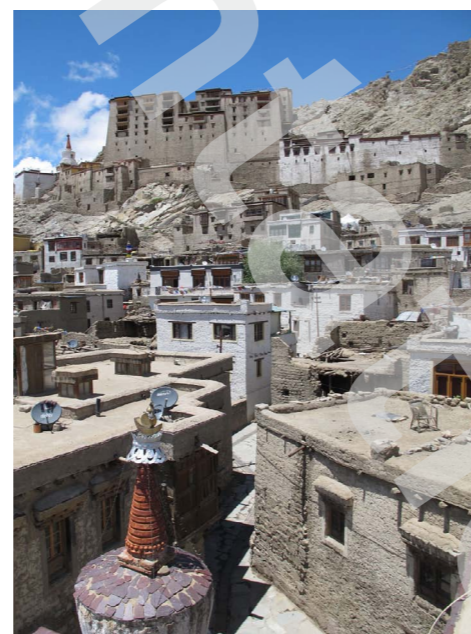
View of the palace overlooking traditional buildings in Leh Old Town

Over the same period, Ladakh's economy and society have likewise changed dramatically. The town of Leh has sprawled far beyond its traditional limits, and many of the