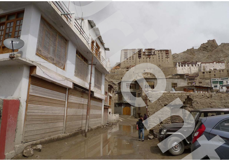
Every year, more new concrete structures are replacing the historic buildings in the Old Town, significantly impacting on a local economy that relies on tourism