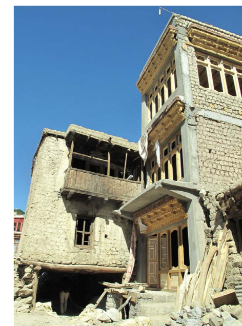
The historic Banday House (left), home of 19th century Ladakhi explorer Baba Kalam Rassul, its wood balcony now blocked in by the concrete balcony of a new tourist facility

buildings in Leh Old Town with individual concrete buildings measuring 25 square metres. Under urban planning criteria in India, concrete structures are categorized as permanent, and stone, adobe and wood structures as non-permanent, awaiting replacement. If this project were implemented, some 40 per cent of Leh Old Town would be replaced by standardized concrete boxes designed in mainland India, where the climate and other conditions differ radically from those in Ladakh. In its conservation programme for the Leh Palace, the Archaeological Survey of India (ASI) has relied on a Central Government act that forbids new construction within 100 metres of a protected monument and restricts construction within 200 metres. However, this ruling has