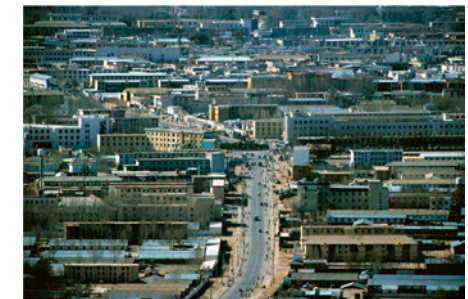
Top: traditional Tibetan depiction of Lhasa (THF). Center: aerial view of modern Lhasa (J. Müller). Below: Lhasa Jokhang temple and Barkor Street (THF).