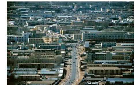
Top: traditional Tibetan depiction of Lhasa (THF). Center: modern Lhasa (J. Müller). Below: Lhasa Jokhang Temple and Barkor Street (THF).