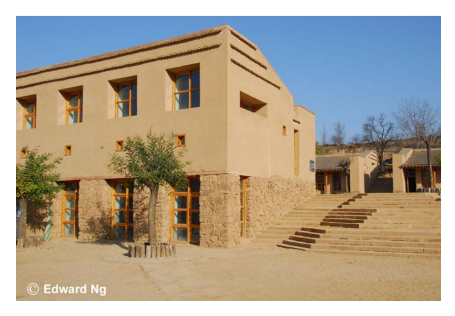
Maosi Ecological Demonstration Primary School (China) wins the Jury Commendation for Innovation in the 2009 UNESCO Asia-Pacific Heritage Awards for Culture Heritage Conservation

The 2009 Heritage Awards Jury Commendation for Innovation was awarded to the Maosi Ecological Demonstration Primary School (China). The Jury Commendation recognizes newly-built structures which demonstrate outstanding standards for contemporary architectural design which are well integrated into historic contexts. The 2009 Jury Commendation submissions include four projects (an educational institution, a mausoleum, an urban district and a residential development) from three countries in the region.