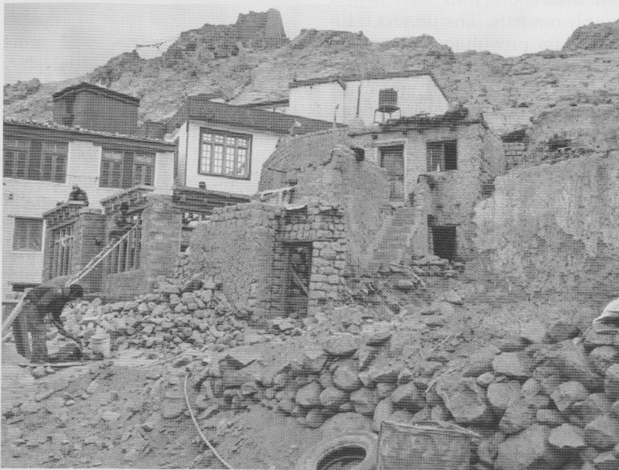
The house being built under the RAY project 151m from the palace

construction of toilets and provision of amenities like water supply, electricity, street lights, sewerage, drainage and solid waste management systems.