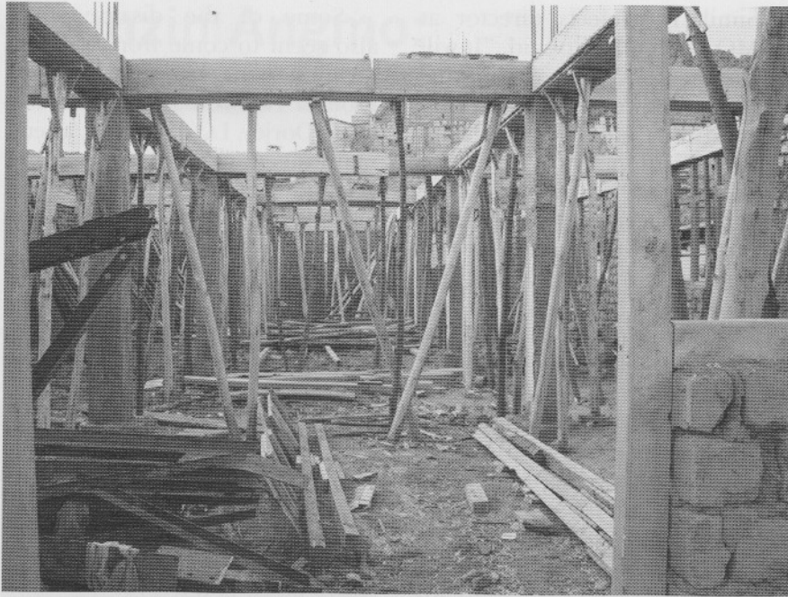
Community Hall being constructed within RAY scheme